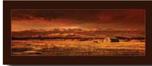
“Storm Across the Valley” by Dwayne Horton