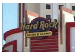
Views of the Hard Rock Hotel & Casino