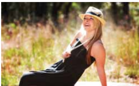
The Oklahoma Photographer