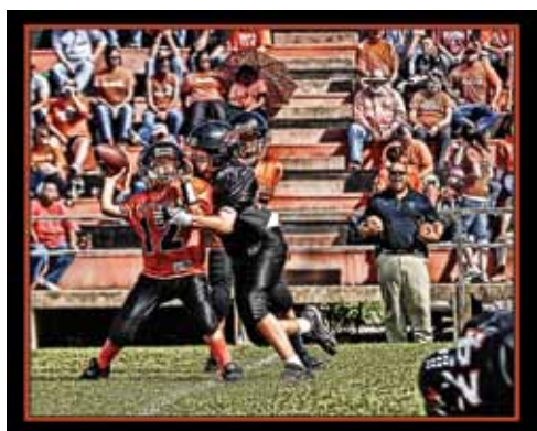
“Sack ‘em” by Craig Smith